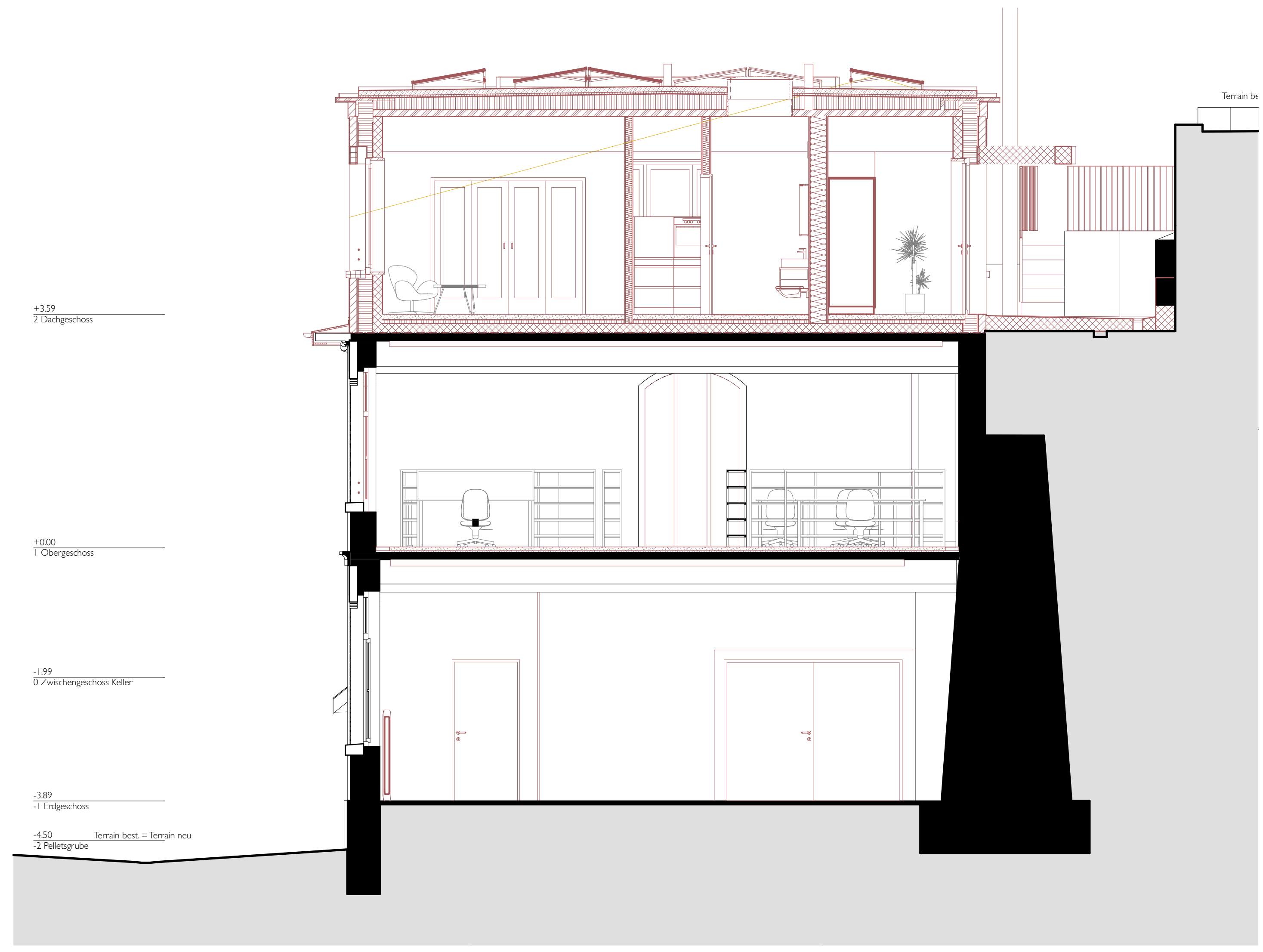
QS-B Querschnitt B 1:50